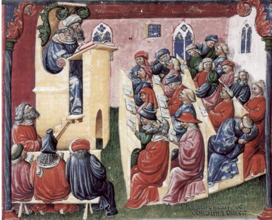
Lecturing in a Medieval University (14th Century)