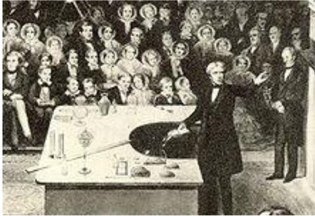
Michael Faraday - 1856